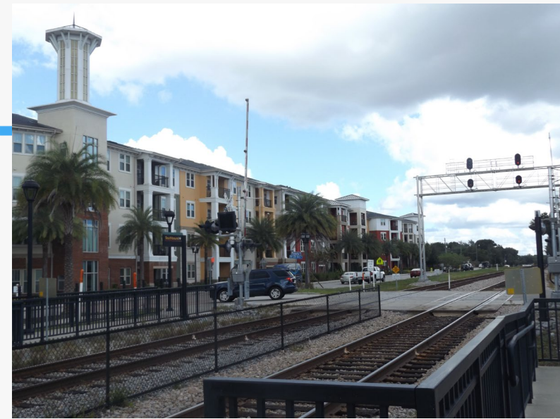
City of Lake Mary, FL