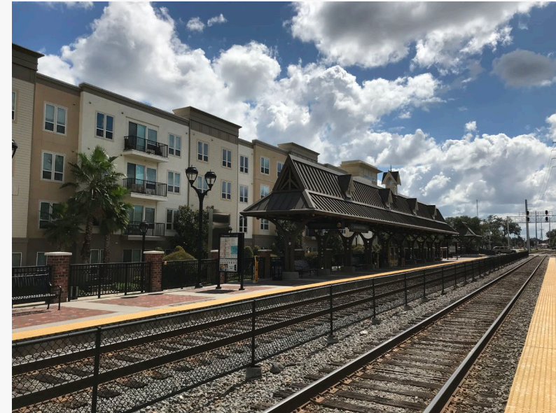
City of Longwood, FL