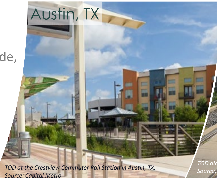
TOD at the Crestview Commuter Rail Station in Austin, TX.