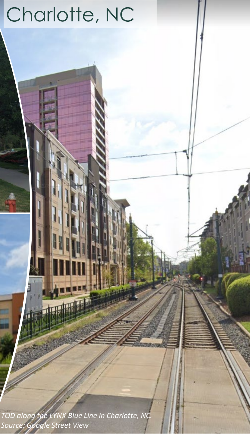
TOD along the LYNX Blue Line in Charlotte, NC.